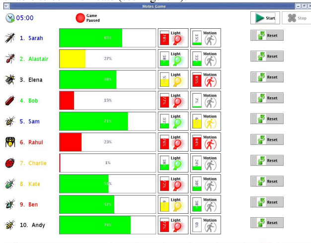
Figure 1: The graphical interface of Trove during a ten-player game. The bars next to each players name indicate the amount of lives left. On the right of each health bar are two indicators showing the current status of each players light sensor and accelerometer.

Facing the players, usually on a projector screen, is a graphical interface which indicates the number of lives each player has remaining, which sensors are currently close to or over their thresholds and reports on whether any motes are unable to communicate (see Figure 1).