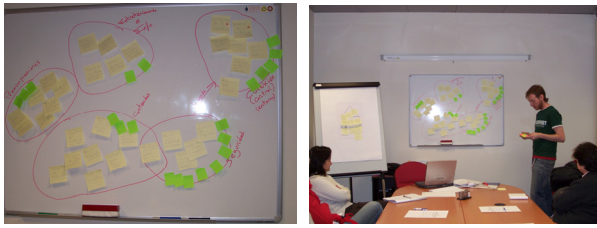
Figure 3: Setting for MyPlace focus group.

Each cluster was labeled by an appropriate title. The participants rated the importance of each cluster.