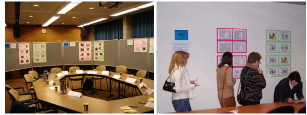
Figure 1: Exhibition rooms at different partner sites.

with a large table and chairs, refreshments, paper, pencils and as an exhibition room showing the visualization of the scenarios. In the reception room, the participants received a general introduction and a short instruction on the tasks that they had to perform in the exhibition room.