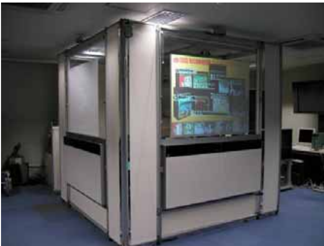
Figure.2 UBWALL Projector model

UBWALL has different models: one is a PDP (Plasma Display Panel) model assembled with 63 inch PDP standing lengthwise, as shown in Fig.1, and another is a projector model assembled with 64 inch glass-screen standing breadth wise in a wall of aluminum-framed small house, as shown in Fig.2. Other input/output devices and sensors are the same for both of two models except display unit.