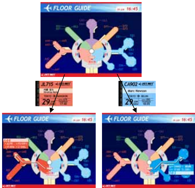
Figure.3 Screen Shots of Airport Scenario

Fig.3 shows some screenshots of an airport scenario. In an airport, there are flight information guide and gate map on large screen already. In general, users have to find out their concern information from many candidates showed on display. Using UBWALL we can avoid these inconveniences. We describe the scenario with UBWALL as follows: