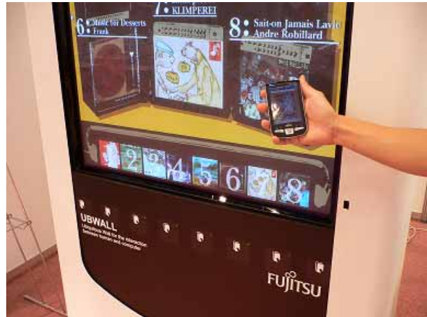
Figure.4 Display Image of Music Shop Scenario

UBWALL works for sales Assistance as a “KIOSK Board”. It indicates “awareness”, which assists shopping depending on customer’s history, and helps sales promotion as well. Fig.4 shows display and PDA image of music shop scenario.