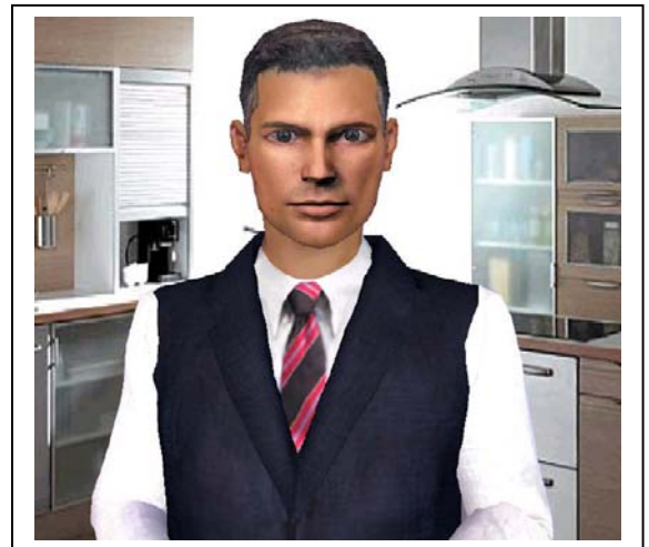
Figure 4: Maior-Domo representation. The avatar