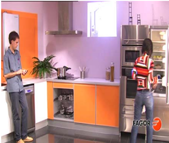
Figure 3: Demonstrator set

This paper presents the partial results of the project GENIO (Genie in Spanish, with the meaning of being the server of your home, who executes user's desires). The services implemented in this demonstrator are: